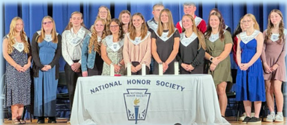
Seven new students are inducted into the Deposit Chapter of the National Honor Society