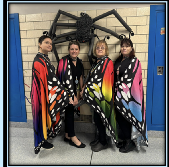
DCS staff gets in on the Halloween fun!

Winter weather is approaching! The District will send text messages, emails, and phone calls about delays and closings. Closings are also posted on our website, Facebook page and local news stations. Make sure you've opted in for text messages by texting "YES" to 68453. Also make sure your phone number is correct in the system.